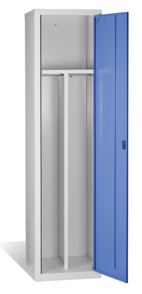
CLEAN & DIRTY LOCKER