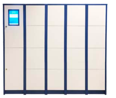
ELECB18 + 4 X ELED18