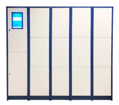
ELECB18 + 4 X ELEC18