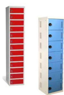
LAPTOP + CHARGING Secure locking. Charging locker slots have 2x USBs + socket