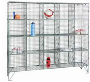
WIRE MESH Many configurations, electroplated bright zinc or powder coated