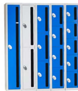
VISTA LOCKERS High visibility and door strength. Ideal for security concerns