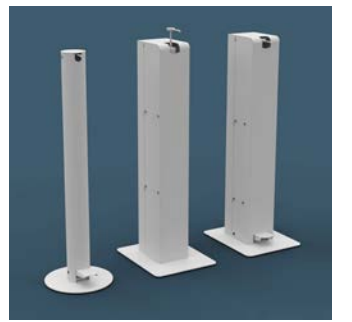
LOGIC Hand-sanitisers, for happier, healthier employees and customers