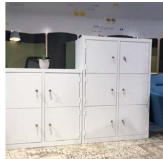
LINEAR Steel office, co-working lockers, highest quality, competitive costs