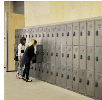
ZETA Industrial style Classic lockers with feature vents