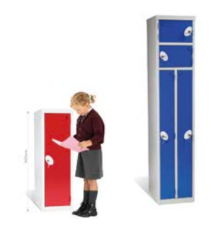
JUNIOR + TWIN LOCKERS Steel carcase / steel doors