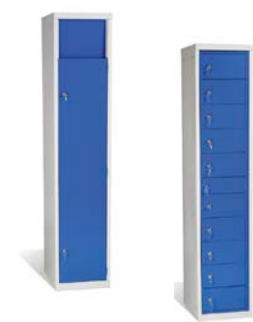
COLLECTOR + DISPENSER Post dirty garments. Dispense clean garments. Door locks are paired