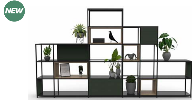
CUBIC Modular system - extremely versatile, perfect for workspaces looking to create an innovative environment.