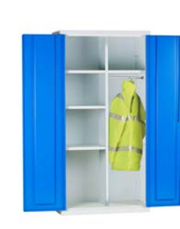
CUPBOARDS and COSHH Cupboards Steel doors / steel carcase