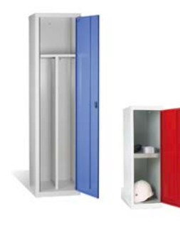
CLEAN / DIRTY + TOOL LOCKERS Steel carcase / steel doors