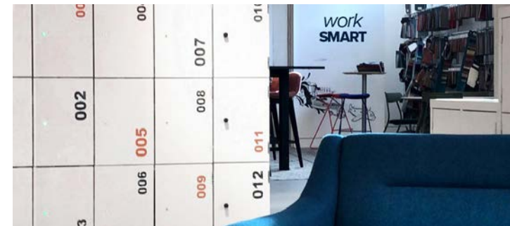
MODE Contact-less SMART Lockers to suit every budget and project