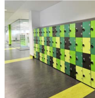
PREMIER LOCKERS Steel carcase / SGL doors Various sizes, door quantities and lock options