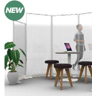
VERTICAL Protective acrylic floor standing screens, mobile or static options