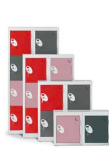
MIDI CUBES Available in 3 sizes, ideal for home-working and schools