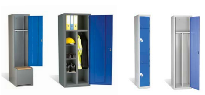
WORKPLACE Lockers designed to store specific items for personnel on duty