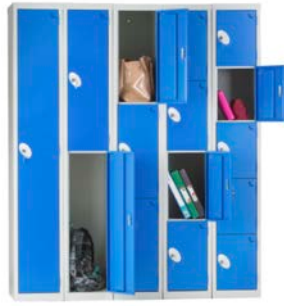
CLASSIC Steel carcase / steel doors Various sizes and door quantities