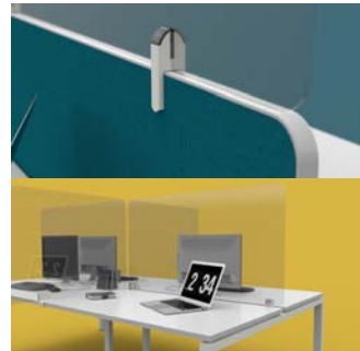
VERTICAL Protective acrylic free standing, desktop and topper screens