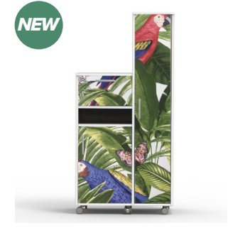
EXPRESSION Healthcare Range, mix of MFC and steel options