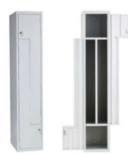
Z LOCKERS Available in Classic, Premier and Supreme Locker ranges