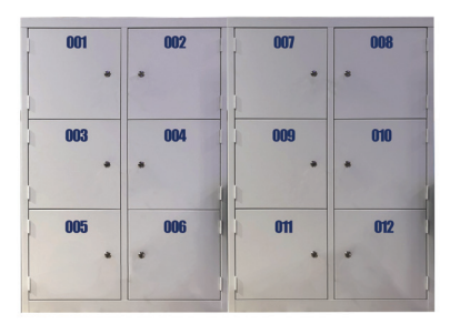
VINYL GRAPHIC NUMBERS